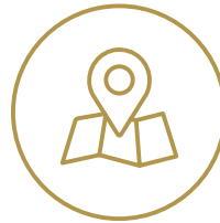
IDENTIFY AND PRIORITIZE KEY RISK REDUCING ACTIONS