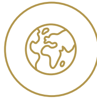
BIG PICTURE VIEWS DOWN TO SITE LEVEL DETAILS