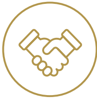
EMPOWERING CLIENTS TO BETTER MANAGE THEIR RISKS