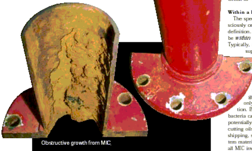
Obstructive growth from MIC.

The specific source of MIC is consciously omitted from the captioned definition. Bacteria is only indicated to be within the fire sprinkler system . Typically, a sprinkler system's water supply is incorrectly considered to be the only source for bacteria. Although there currently are no conclusive relational studies in the fire protection industry, there are growing beliefs this is not the only source of bacterial infection. Besides all water sources, bacteria capable of causing MIC are potentially present in all soil, air, and cutting oils. Thus the manufacture, shipping, storage, and flushing of system materials should be addressed in all MIC investigations.