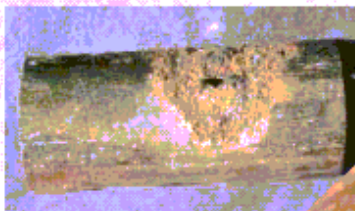
Above Top: Interior pitting and roughness created by MIC. Bottom: Exterior pinhole.