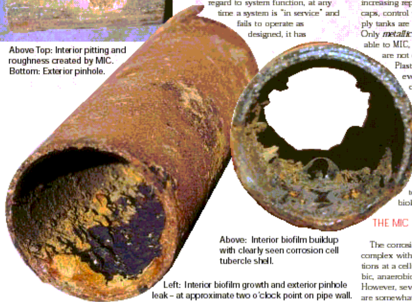
Above: Interior biofilm buildup with clearly seen corrosion cell tubercle shell.