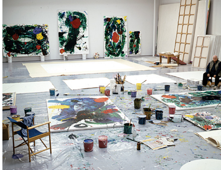
Sam Francis in his Venice, California studio, November 1989.

This monumental, panoramic work exemplifies Francis's enduring fascination with immersing the viewer in the profound space-time of painting, a captivating concept that reflects his deep engagement with both alchemy and psychology, revealing layers of meaning and experience.