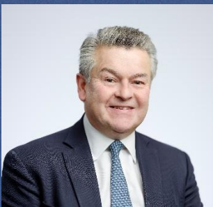
David Gerrish Motor