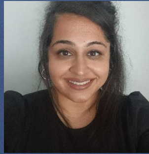
Poonam Sejpal Motor