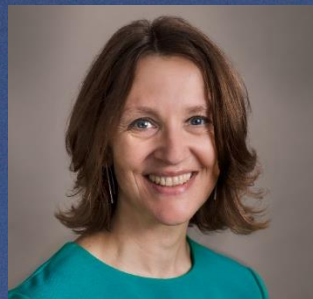
Esther Nolla Reynolds Property