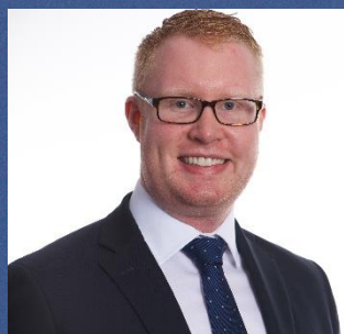
Chris McGuire Risk Consulting