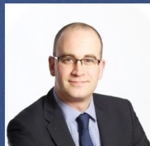
Neil Howard Motor